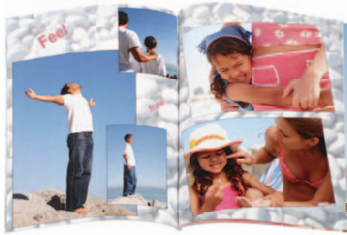
(a) page of a photo book