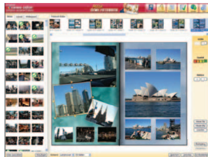
(c) background selection