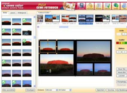
(b) preselected photos